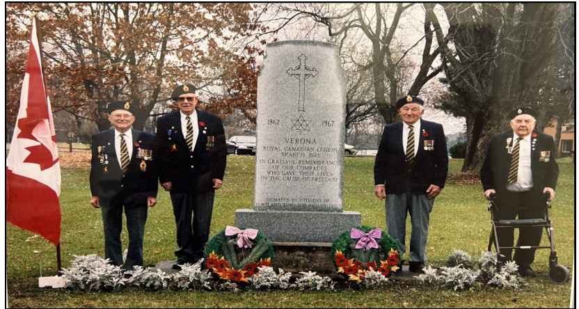
Our Trinity United Church, Verona, WWII Veterans, November 11, 2006

Please join us for our Trinity Remembrance Day Church Service at 10:00 a.m on Sunday November 10th, and the Verona Area Service at McMullen Manor at 11:00 a.m on Monday November 11th, followed by a light lunch at the Verona Free Methodist Church.